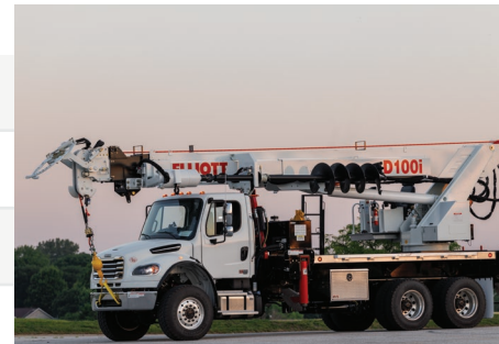
D100i Digger Derrick